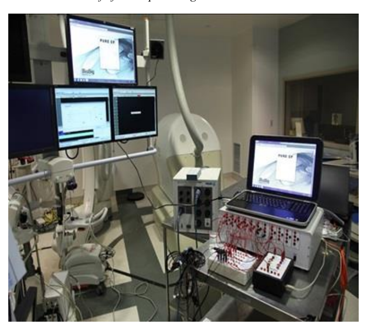
The current PURE EP System prototype